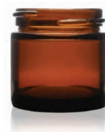
1 oz Amber