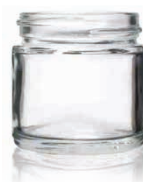
1 oz Clear