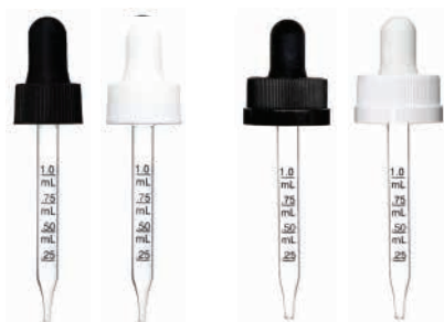
Non-CRC Black or White