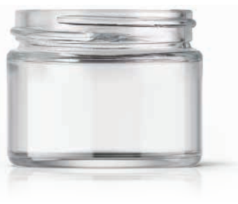
2 oz Clear