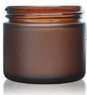
2 oz Frosted Amber