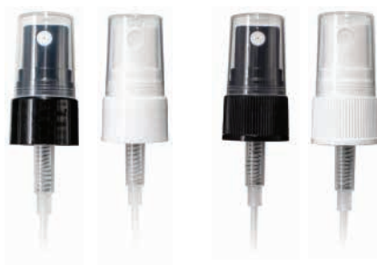
Smooth Skirt Black or White